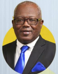
SHERFIELD BOWEN ST. PHILLIP SOUTH